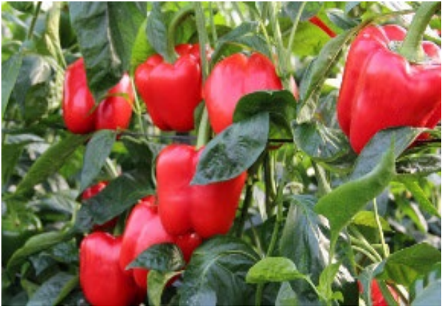
Cultivo de pimiento con MicroSoil®. / Peppers grown with MicroSoil®.

Cultivo con MicroSoil®. Homogeneidad y Calidad del pimiento. / Red Peppers grown with MicroSoil® have higher quality fruits with more uniformity of size.