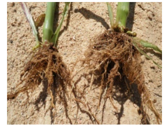
Otros / Others