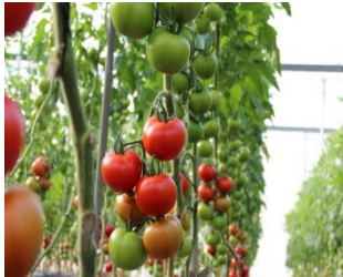
Hortícolas / Horticulture