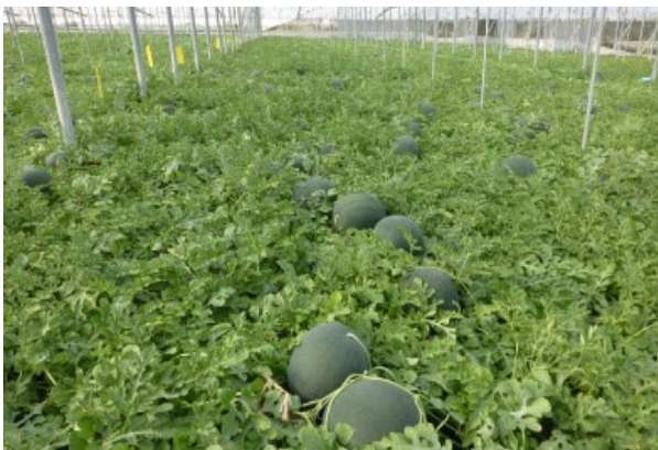
Sandía con pepitas, tratada con MicroSoil®. / Seeded Watermelon treated with MicroSoil®.