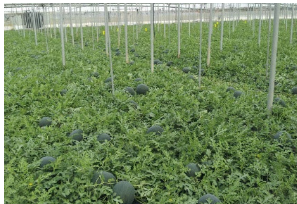
Sandía sin pepitas, con MicroSoil®. / Seedless Watermelon grown with MicroSoil®.