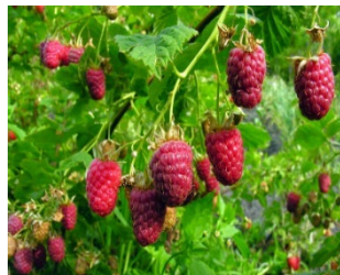
Bayas / Berries