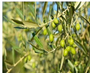
Olivos / Olives