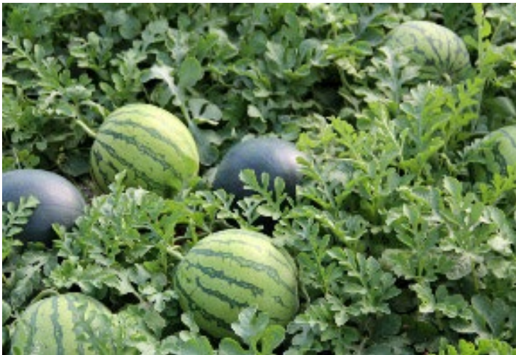
Cultivo de sandía con MicroSoil®. / Watermelon grown with MicroSoil®.