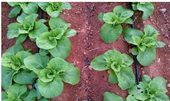
Col China fila izquierda tratada. / Chinese Cabbage treated with MicroSoil® (left row only).