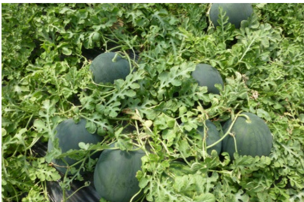
Sandía sin pepitas, tratada con MicroSoil®. / Seedless Watermelon treated with MicroSoil®.