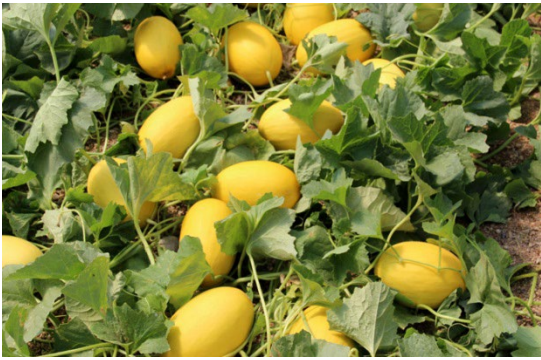
Cultivo de melón con MicroSoil®. / Melons grown with MicroSoil®.

Melón Piel de Sapo con MicroSoil®. Calidad y Calibre. / Toad Skin Melons grown with MicroSoil® have higher quality fruits with larger size.